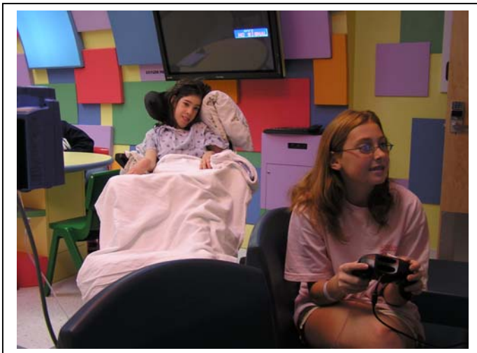
Patients enjoy the new Lion's Den Room

"The reaction of our room's first "guest" tells me that it was all worthwhile."